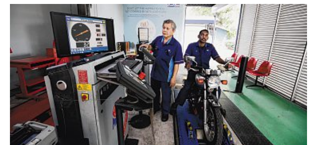
Vicom says installation of the new on-board units as part of the refreshed Electronic Road Pricing system has commenced.

Shares of Vicom fell 0.7 per cent or S$0.01 to close at S$1.35 on Friday.